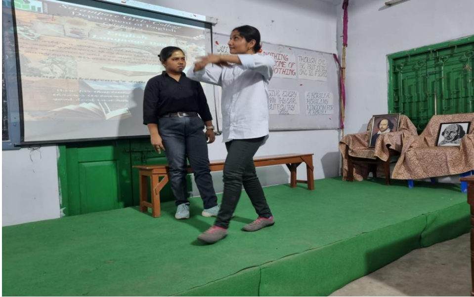
Play- Acting from Romeo and Juliet