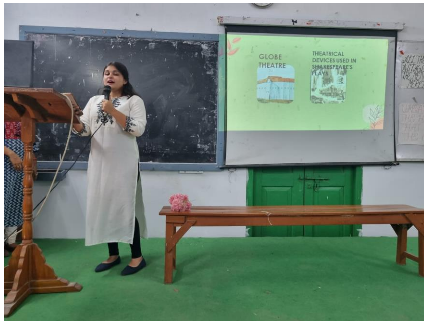
PPT Presentation by the Students