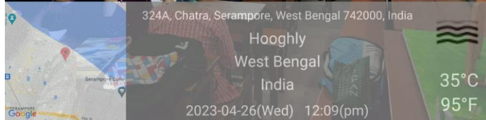
Open House Program; 2022-2023 Session; semester –II, IV, VI