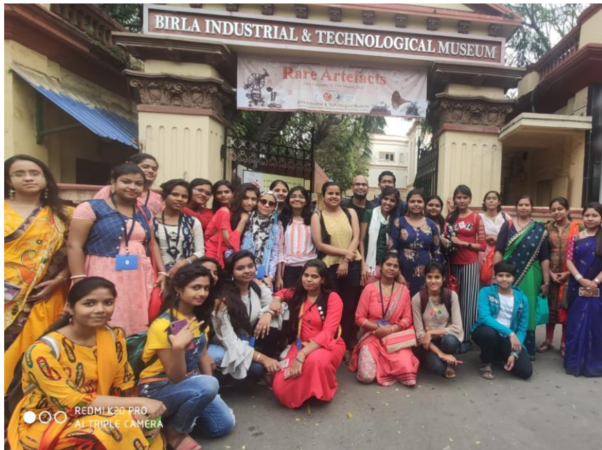
Image of Educational Tour Academic Session 2019-2020

Date: 05 th March, 2020 to Birla Institute and Technology Museum, Kolkata