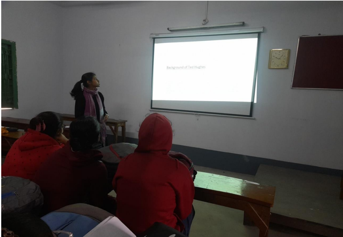
PEER TEACHING SESSION