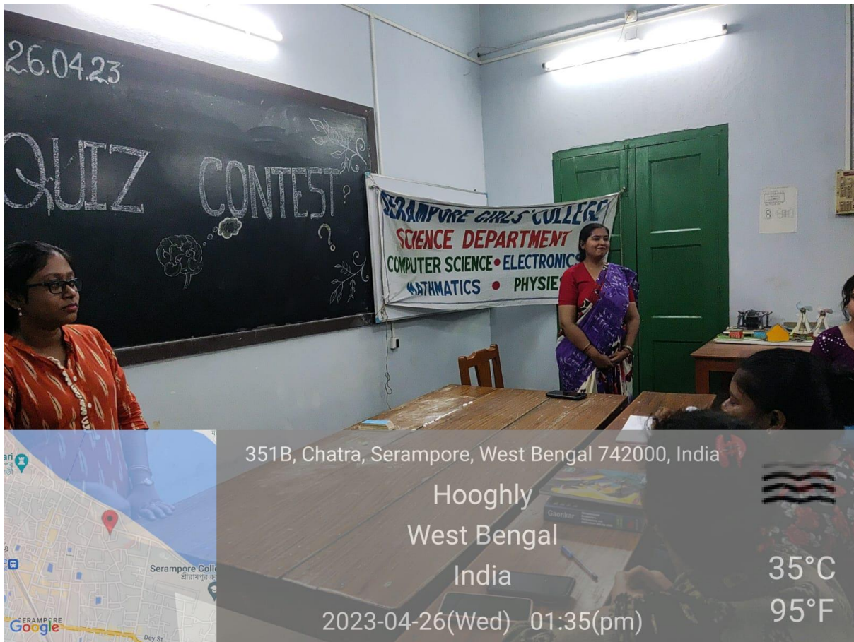
Quiz Contest; 2022-2023 Session; semester – II, IV