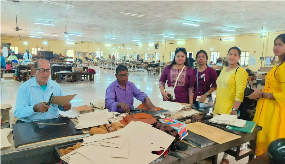
The students in the Leather Workshop