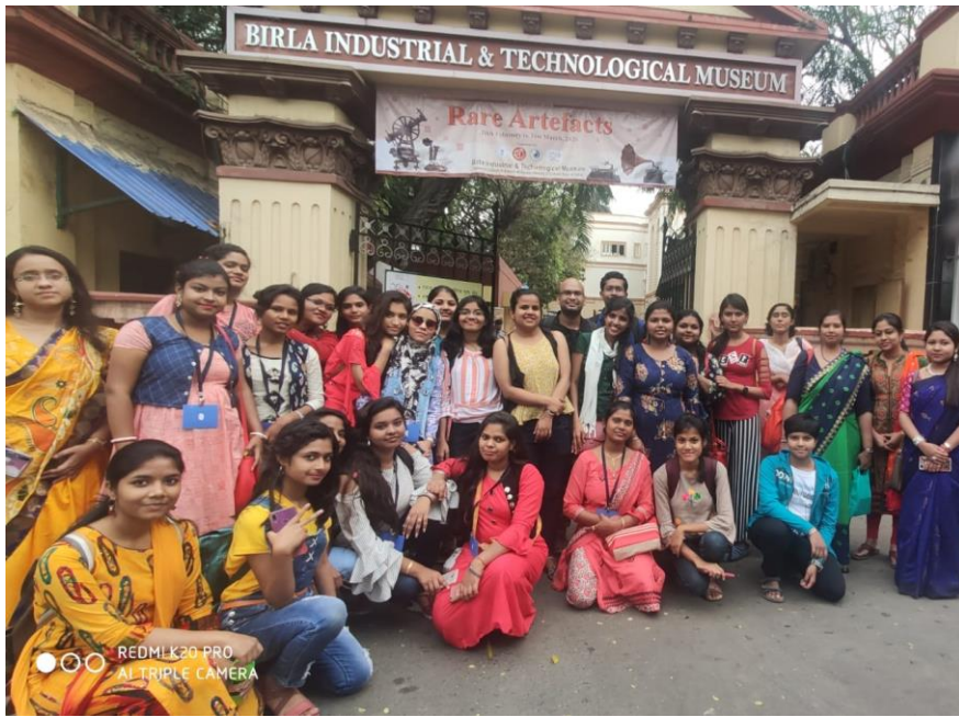
Study Tour to Birla Institute and technology museum, 05.03.2020 SEM:2 and 4