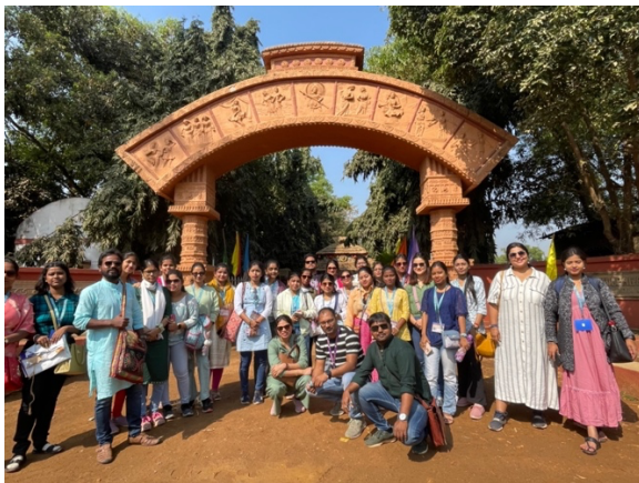
Heritage (Regional Winner for Capture Culture)