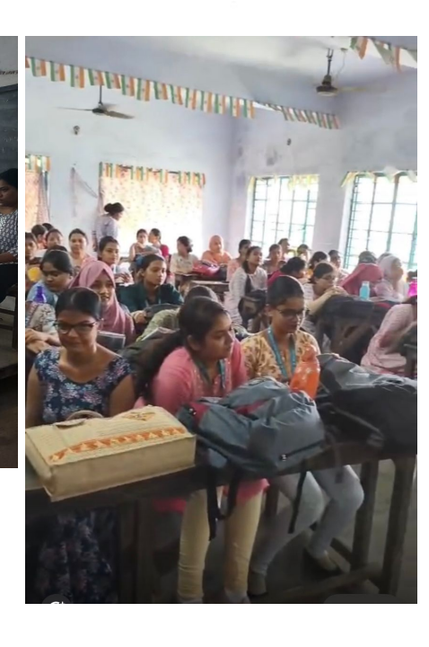
2nd and 4th semester Students attendance sheet