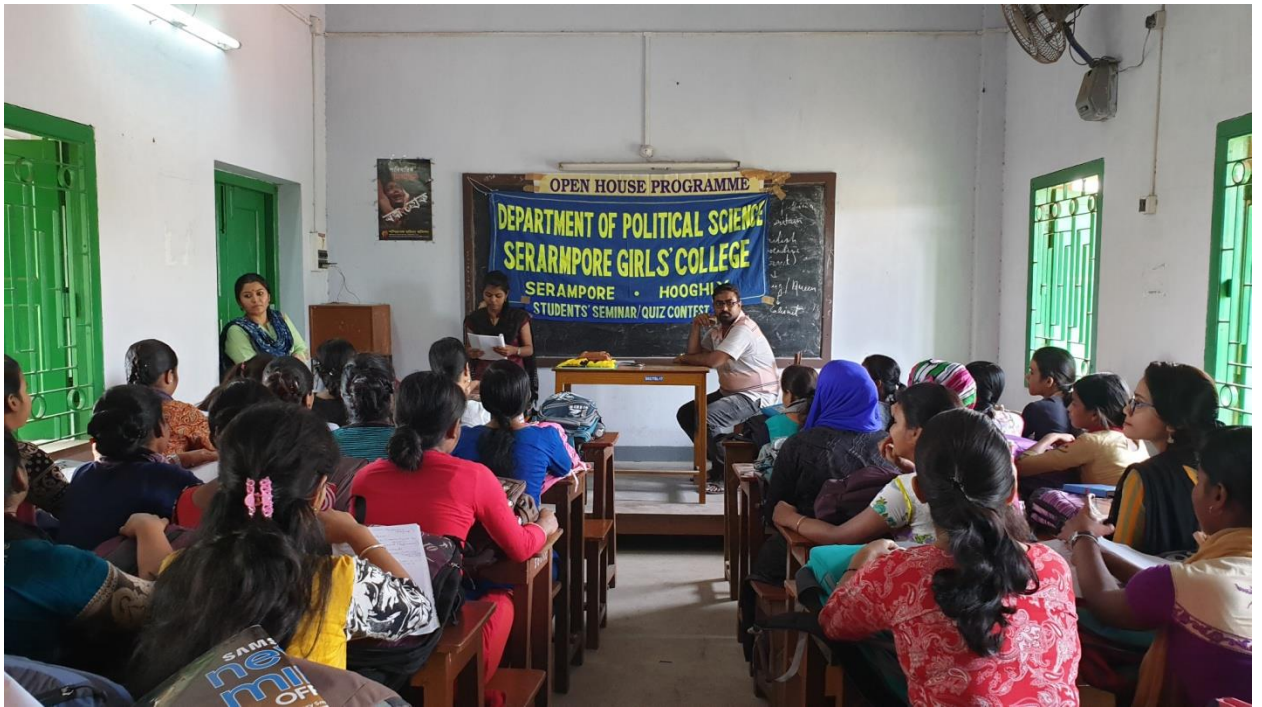
DATE- 26.03.2019, NB-10