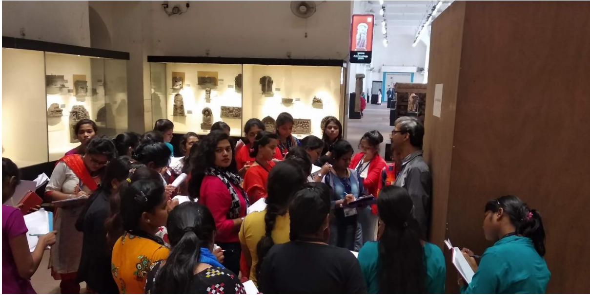
GANDHARA ART GALARY , INDIAN MUSEUM, KOLKATA, 3 RD , DECEMBER, 2020