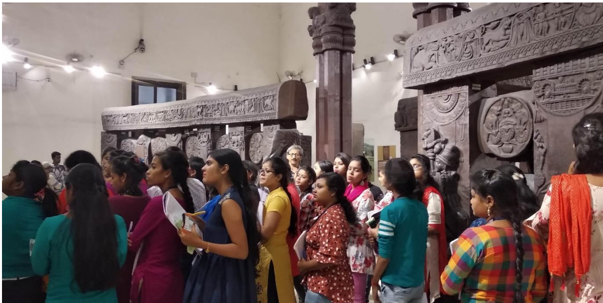
BHARHUT ART GALARY , INDIAN MUSEUM, KOLKATA, 3 RD , DECEMBER, 2020