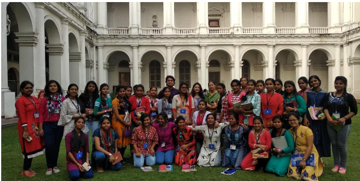
INDIAN MUSEUM, KOLKATA, 3 RD DECEMBER, 2020