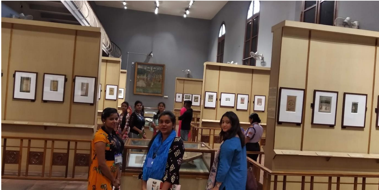
GANDHARA ART GALARY , INDIAN MUSEUM, KOLKATA, 3 RD , DECEMBER, 2020