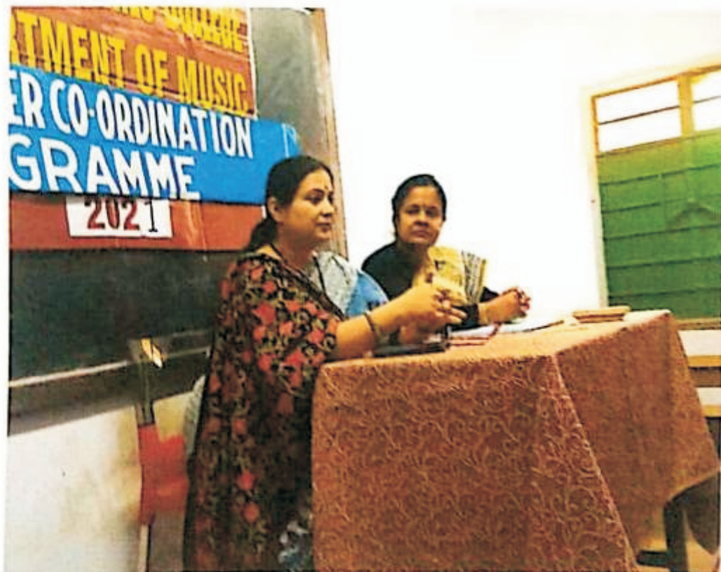
Parent-Teachers Meeting 2021