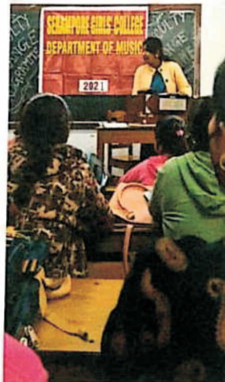
Faculty Exchange Programme 2021