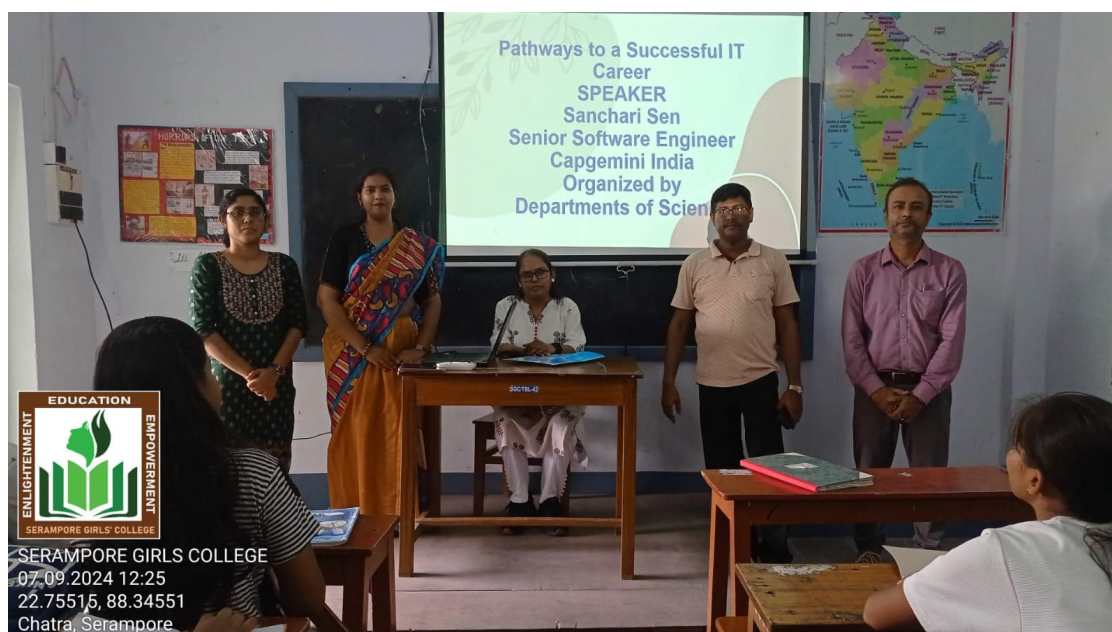
PHOTO OF THE EVENT