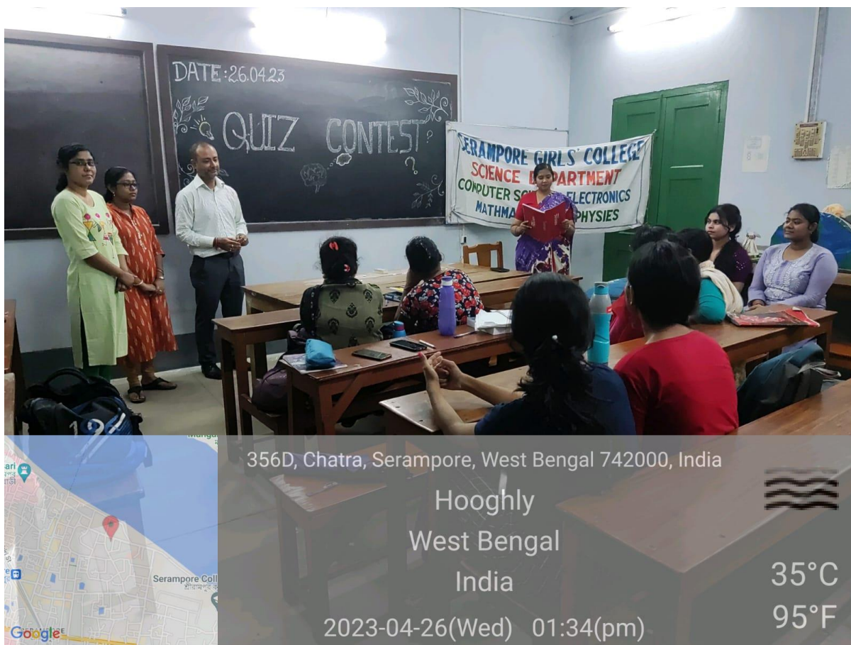
Quiz with students; 2022-2023 Session; semester –II, IV, VI dt: 26/04/2023